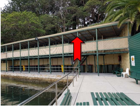
Photo 1. Exterior, throughout, walls and beams – suspected lead-containing yellow and green upper coloured paint systems.